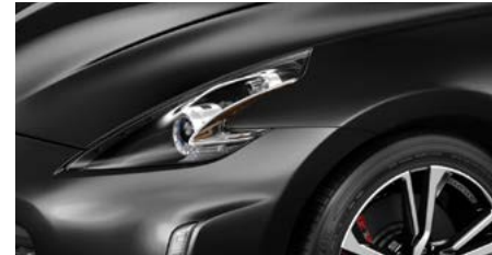
Diamond Black (M) G41