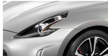
Brilliant Silver (M) K23