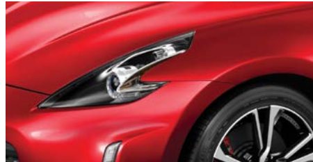
(NEW) Passion Red (NEW) (PM) NBA