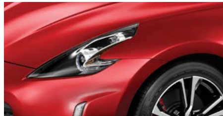
Vibrant Red (S) A54