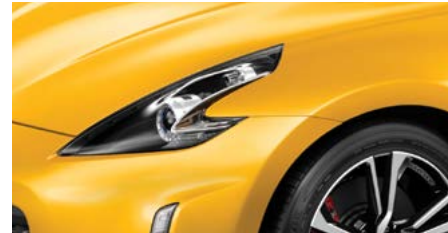
(NEW) Ultimate Yellow (S) EAC