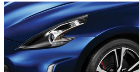
Aurora Flare Blue (P) RAY

S - solid M - metallic PM - pearl metallic