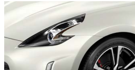
Pearl White (M) QAB