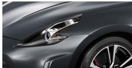
Gun Metallic (M) KAD